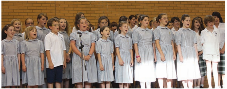
Our School Choir

A very special thank you to everyone involved who made this fantastic evening possible.