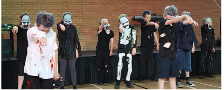
'Thriller' performed by Years 5 and 6